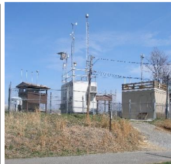
Look Rock Monitoring Station & Observation Tower