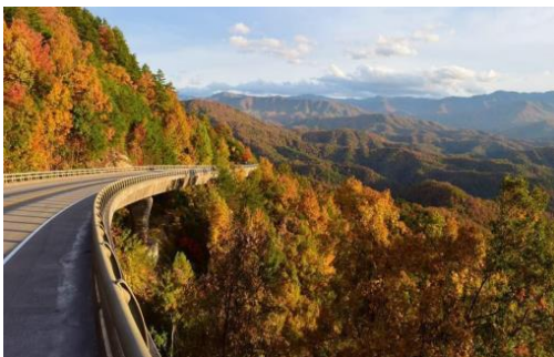
Foothills Parkway, GRSM